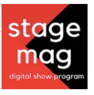
TAKE ME OUT