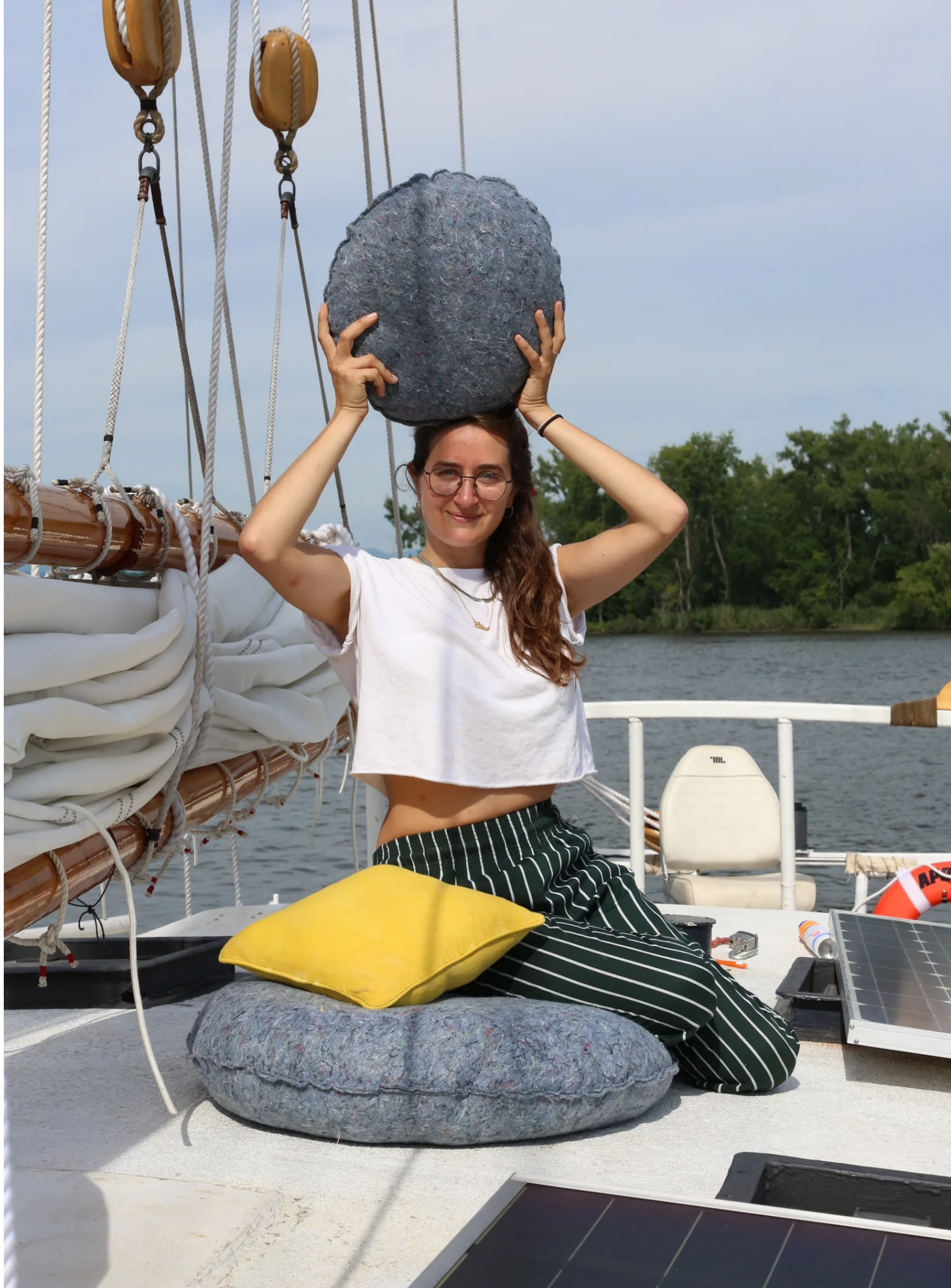
The throw pillows getting cozy on the Apollonia .