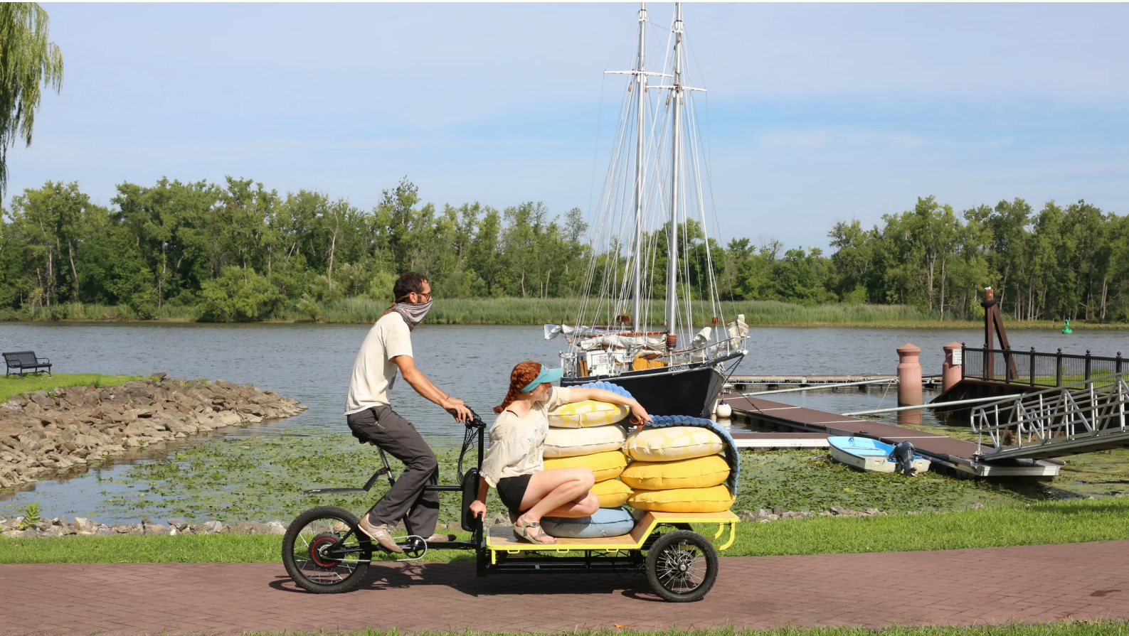
CRCL.EARTH pillows on their way to the Apollonia.